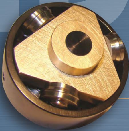
DRILL PRESS SWAGERS

Engineering & Design Support Product & Use Training